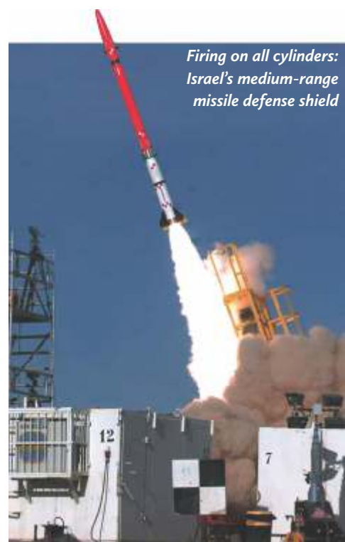
Firing on all cylinders: Israel’s medium-range missile defense shield

The Arrow 2 anti-missile system, which is operational, and the Arrow 3 (under development) are Israel’s answer to longrange threats. The Arrow 3 is making significant progress: In the latest test, it brought down a ballistic target missile in outer space.