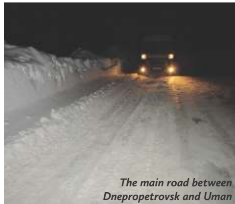
The main road between Dnepropetrovsk and Uman

By Koen Carlier, Christians for Israel Leader in Ukraine