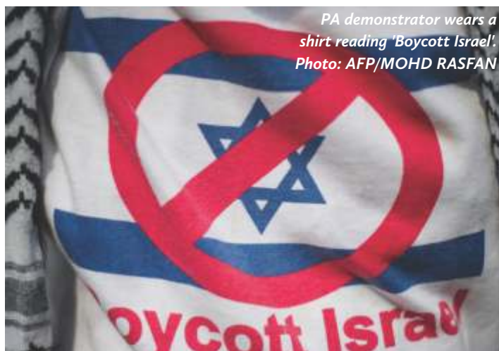
PA demonstrator wears a shirt reading 'Boycott Israel'.