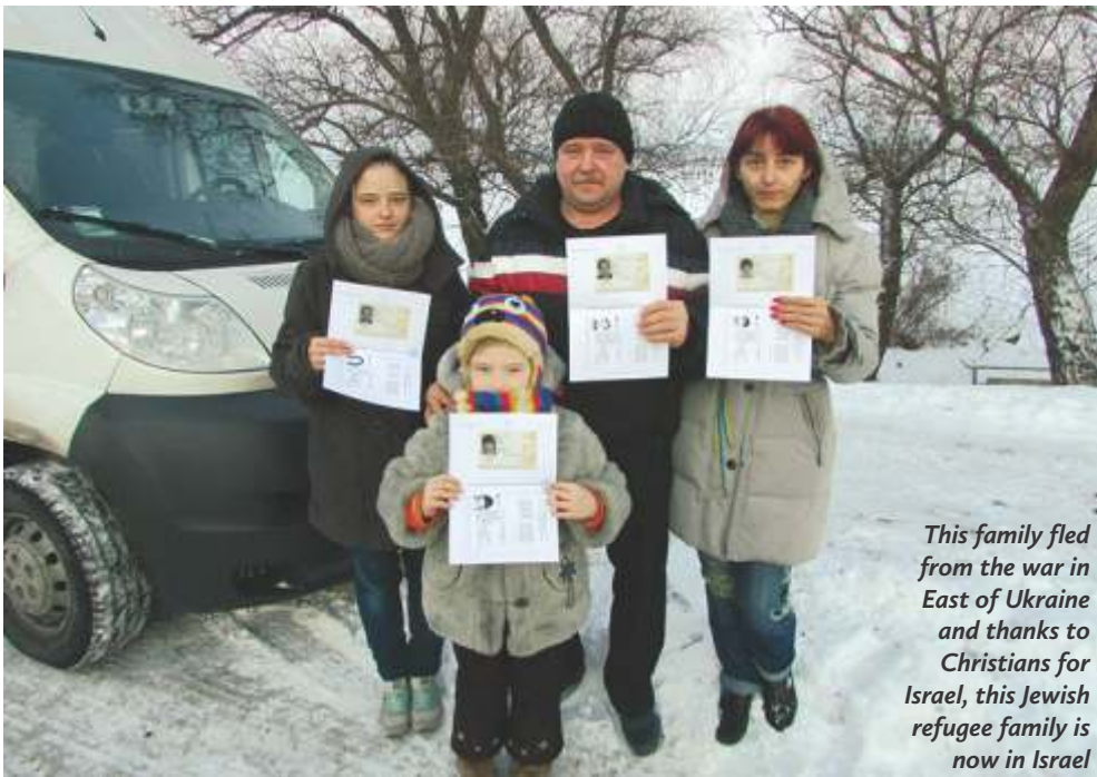
This family fled from the war in East of Ukraine and thanks to Christians for Israel, this Jewish refugee family is now in Israel

The third trip was due to another Consular day in the South-east city of Melitopol. Here two Consular Representatives also addressed the potential two hundred olim, who were brought with minibuses from Mariupol, Berdyansk, Tomak, Zaporozhe. In February 2015, the bus of the last Jewish families from Volnavakha, was hit by a mortar-shell. In this incident many people were killed and gravely injured.