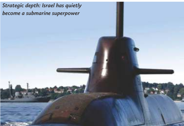
Strategic depth: Israel has quietly become a submarine superpower

submarine fleet is a deterrent to those who seek Israel’s destruction. Enemy countries “need to know that Israel is capable of hitting anyone who tries to harm us with great force,” he said. “And Israel’s citizens need to know that Israel is a very strong country that is doing everything to defend them, everywhere and on every front.”